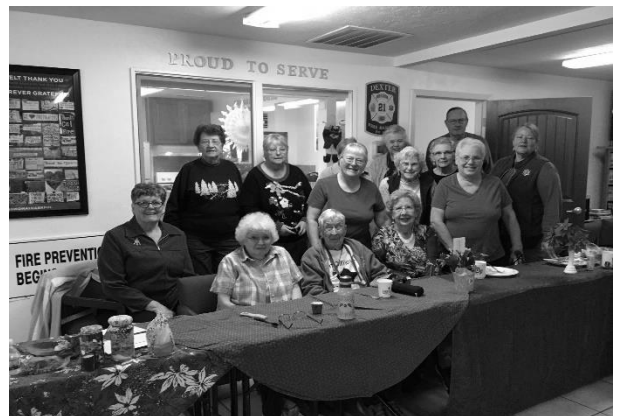
Lost Creek Christmas Party Lane County